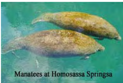
Manatees at Homosassa Springs

We love our 17' ABS canoe and I use my bike as a shuttle vehicle when we can. This year we decided since many of the streams are slow flowing that we could paddle upstream and then float back to camp. We found it fun attaining the class 1 riffles.