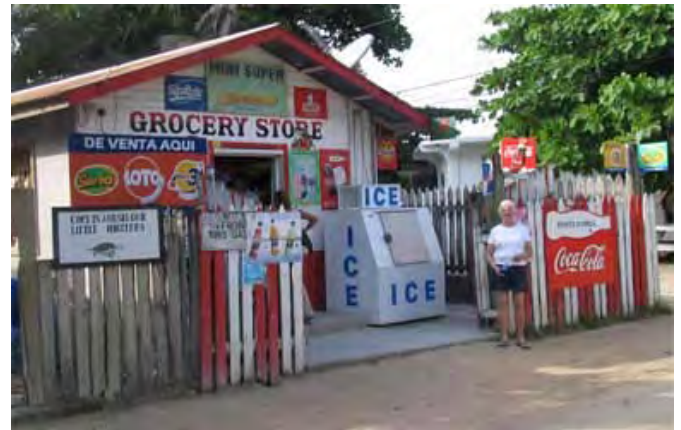
One of the several grocery stores nearby