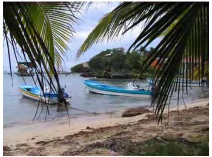
View of Beach near Posada Arco Iris

Judi & Larry were continuing on to Corn Island, Nicaragua. Peggy and I were heading back to the mainland for a night in San Pedro Sula before heading back to Atlanta where we left our RV. The Priem's got back to Houston OK but the big snowstorm in Cleveland caused all flights to be cancelled so that the Drysdals' and Hombergs' ended up in Atlanta stuck for three days. We met them there and continued our partying.