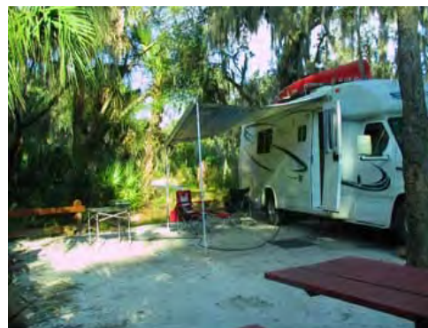
Lithia Springs County Park

The furthest south we got to was Sarasota.