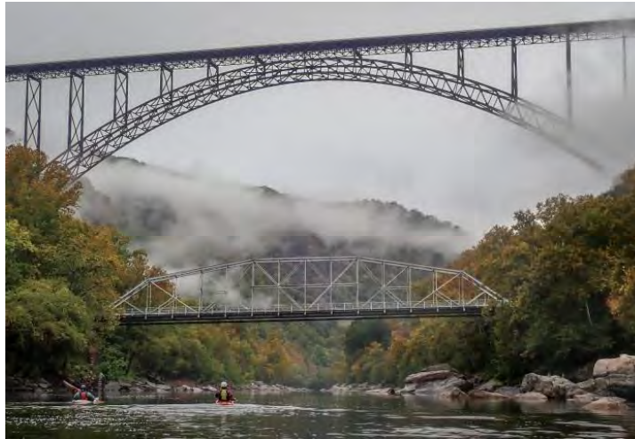
A fall day on the New River.

Polluted, closed mine site leaks toxins into tributary of New River in West Virginia.