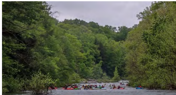
Paddlers below Showers Rapid on the Stonycreek during the 2017 StonyFest.