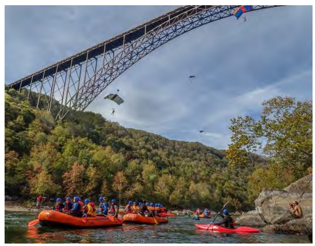
Bridge Day on the New River Gorge is a sight to behold! Hundreds of people watch it from the deck of the Gorge Bridge, but the best views are found on the water below.