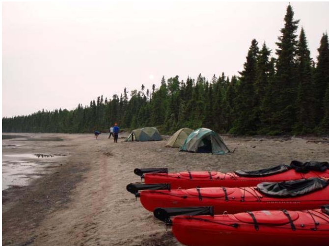
Typical Beach Campsite

water about 1.5 feet below normal, many beaches had opened up. At high water, campsites would be very hard to find.