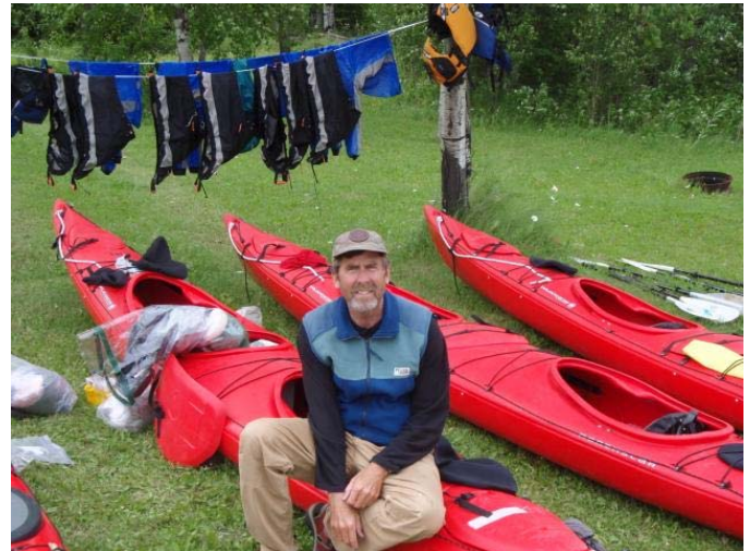
Author At The End Of the Trip - Gear Drying

(courtesy of the fisherman), spring water, and a not-smelly outhouse.