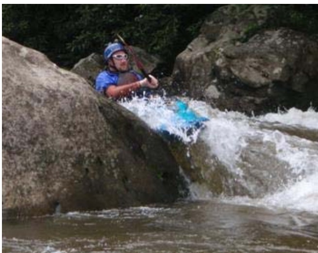
Boof at Bastard