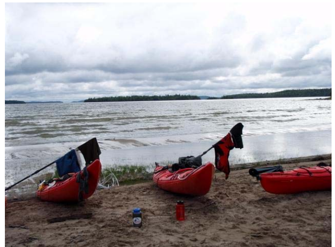
Drying Gear With No Trees

and quickly set up the tents just behind the beach in some long grass. By then we were all wet as well as cold and hypothermic. We spent the next 4 hours in the tents in sleeping bags trying to stay warm while listening to the rain, wind and pounding waves. Around dinner time the rain quit but we still had cold, wind and waves. The next day, more of the same less rain so we could not move but we did manage to dry out clothes and sleeping bags.